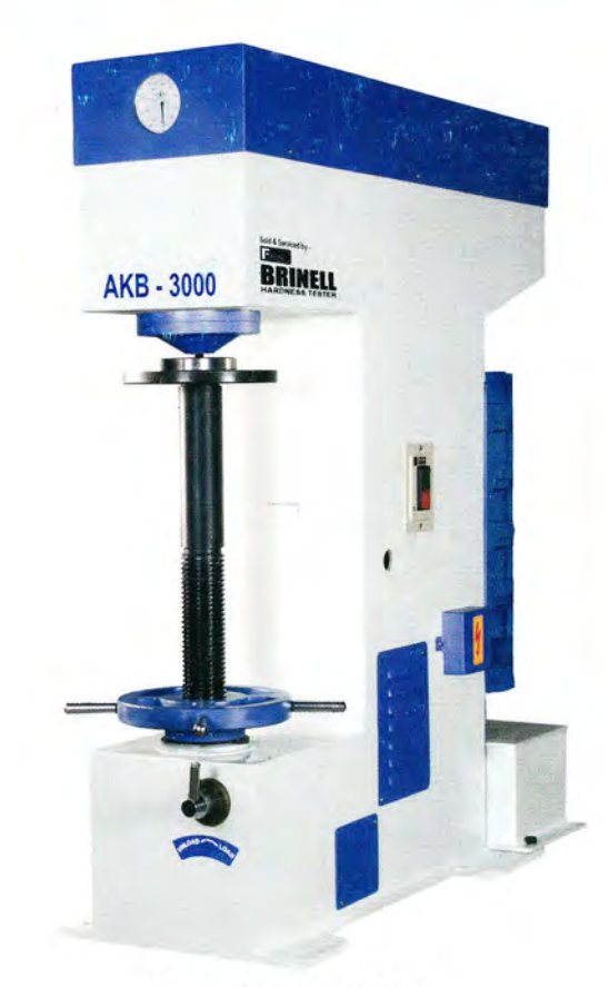
Model : AKB - 3000