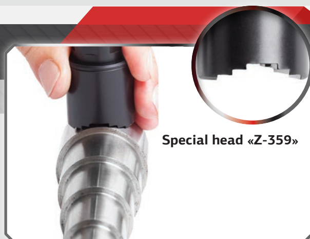
Special head «Z-359»