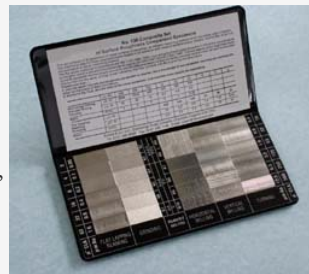
Composite set type 130

The label states the Ra values of each specimen in both metric and imperial units. (Rz-value label available on request).